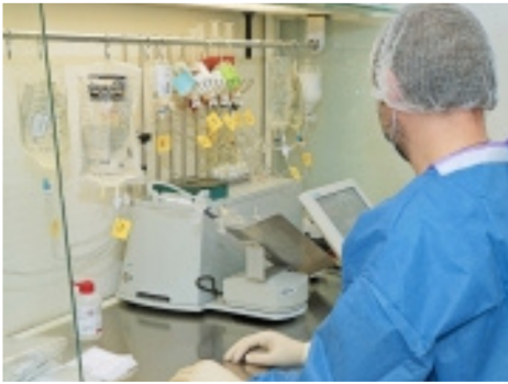
EAHP's Position Paper on Pharmacy Preparations and Compounding

At the beginning of October, the member organisations of the European Association of Hospital Pharmacists (EAHP) adopted a new position paper on pharmacy preparations and compounding. The position aims at providing information about the practice of pharmacy preparations and compounding in hospitals and asks for a stronger embedment of compounding and reconstitution practices in European hospital pharmacies, linked to increasing capacity and training.