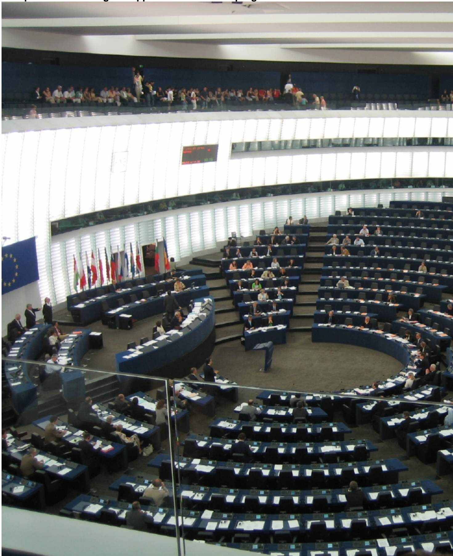
European Parliament gives approval to EU health programme 2014-2020