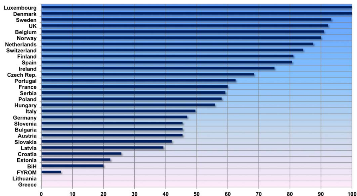
Figure 3 Percentage of hospital pharmacies with an implemented system to ensure patient safety (n=914). BiH, Bosnia and Herzegovina; FYROM, Former Yugoslav Republic of Macedonia.

limitations discussed above—is wide. In the USA, in 34% of hospitals, pharmacists work on the ward for 8 h/day 3 ; in Europe, only 6% of pharmacies have pharmacists spending at least 50% of their time on the ward. In 71% of US hospitals, pharmacists review and approve all medication orders before the first dose is administered (except in procedure and emergency situations). We do not have specific data on this for Europe but the results on general clinical activities do not suggest such involvement. It is important to develop this role in terms of patient safety and proper use of medicines, as studies repeatedly indicate the value hospital pharmacists can bring to safe patient care in this area. Our data also show that development of these roles is of major interest to European hospital pharmacists.