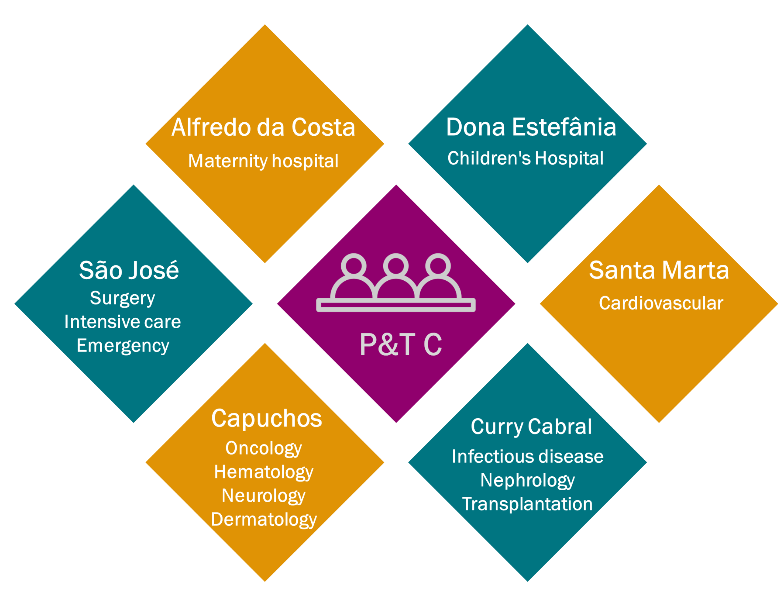
Figure 1 ULS São José: secondary care structure (6 hospitals)