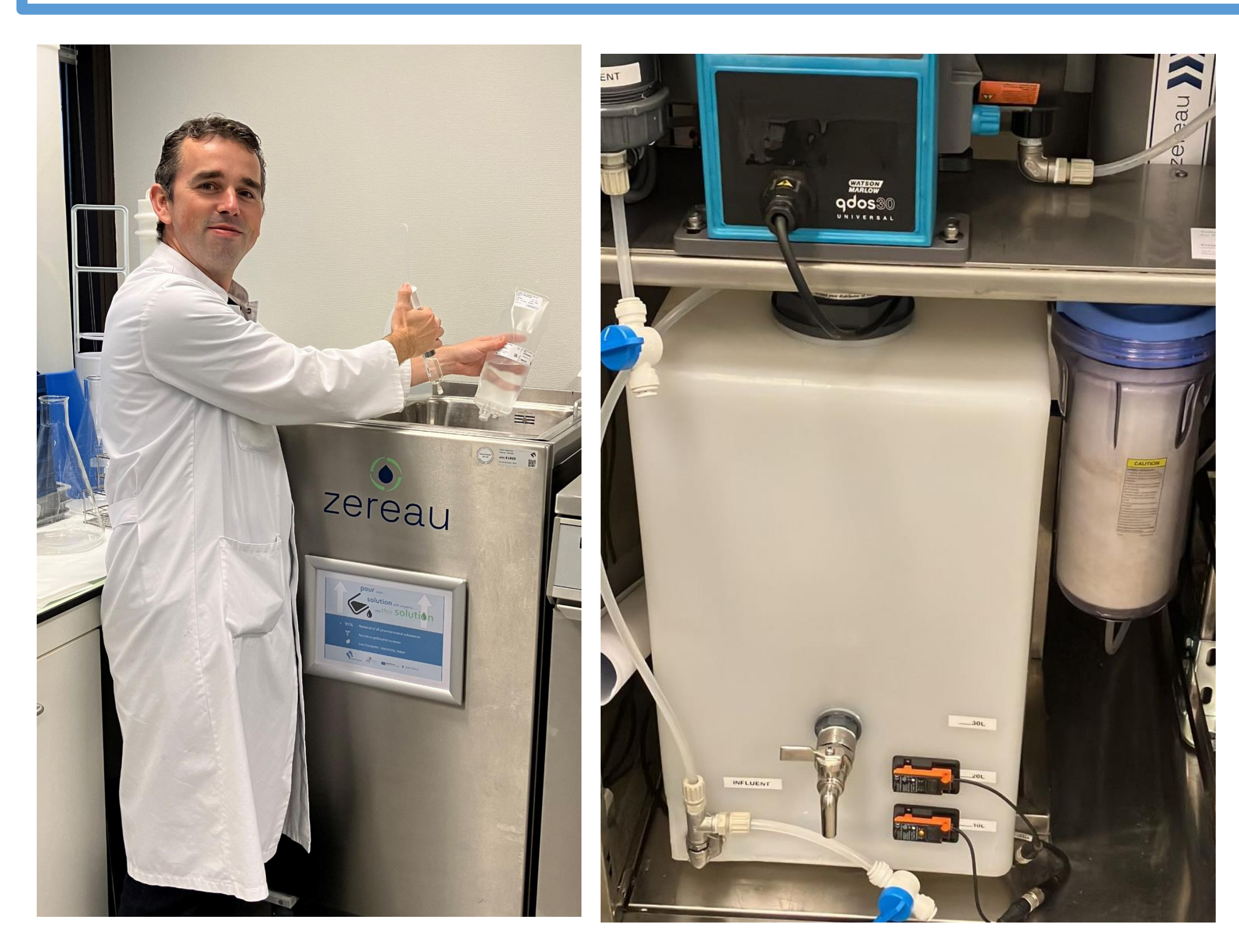
Figure 3 (left): filterbox in use.

The possibility of placing more filterboxes for wastewater collection in other wards in the hospital will be investigated. Cost effectiveness and sustainability compared to alternative waste collection methods will be evaluated.